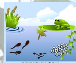
Diagram of the Frog Life Cycle